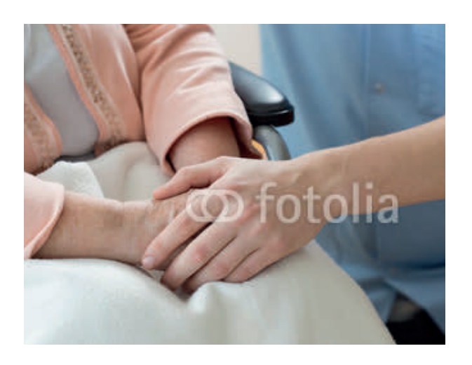
We are here to help and support YOU

Care Coordination is a service provided by trained professionals who assess needs, coordinate services, and guide you through the complex world of public and private social service supports, insurance, financial information and more.