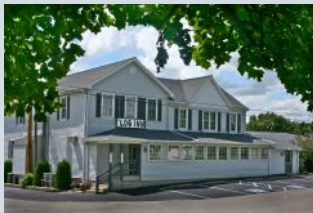
12491 County Road 200 East, Warrenton, IN