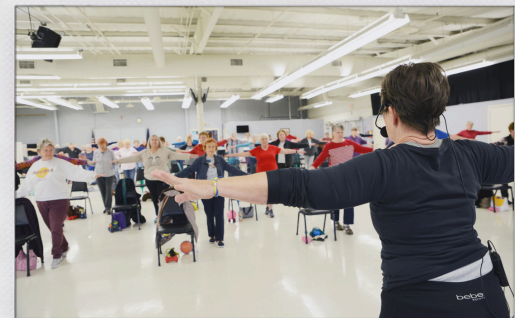
EXERCISE CLASS IN OUR ACTIVITY CENTER