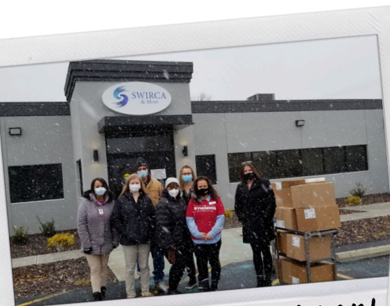
OUR VOLUNTEERS ROCK!

Thank you for helping the most vulnerable in our community stay active and independent!